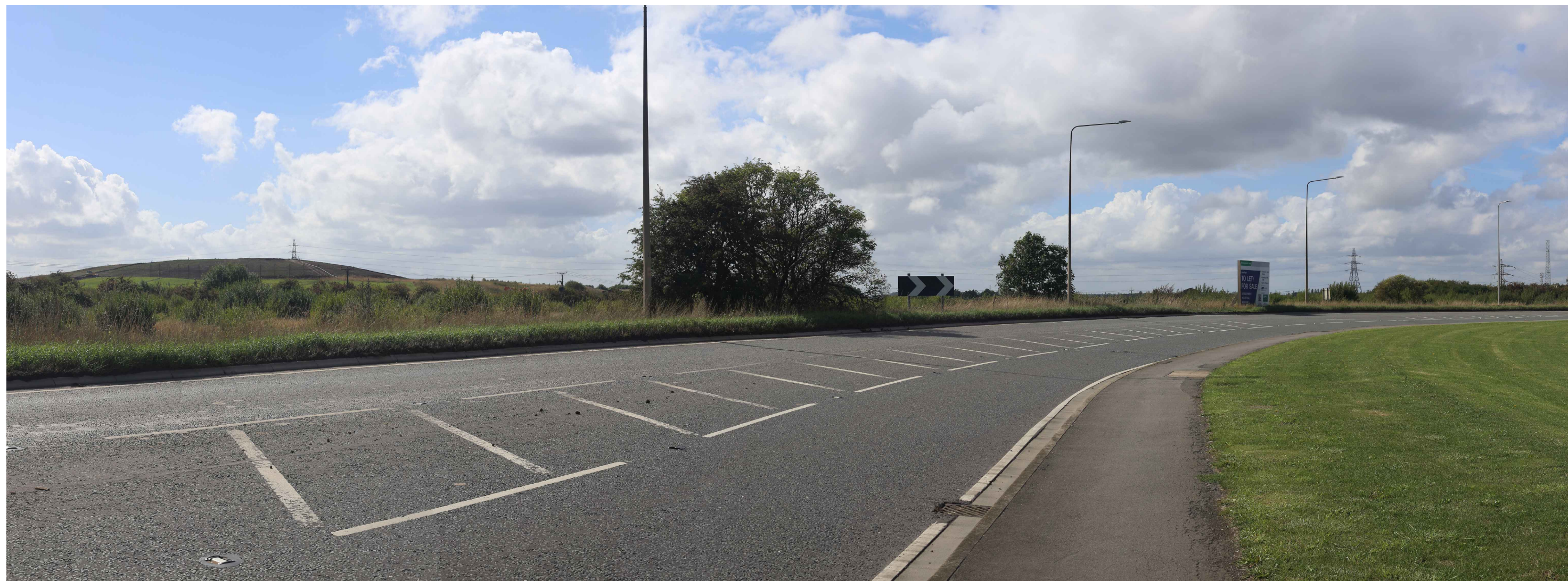
Extent of 50mm single frame image

This image provides landscape and visual context only