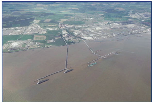
Aerial view of IGET proposals (terminal)