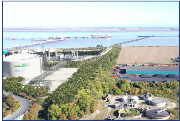
The proposed Jetty and East Site, looking towards the Humber