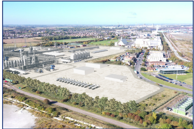
Proposed West Site, including hydrogen processing facility