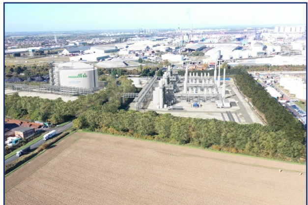
Proposed East Site, including hydrogen processing facility and temporary construction area in the foreground